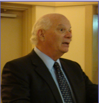
Senator Cardin receiving his award from NAMI Maryland

At special awards dinner on Friday evening, we had the chance to say thank you to four people who have been instrumental in advancing the cause of mental health and working to see that Marylanders with mental illnesses are better served: